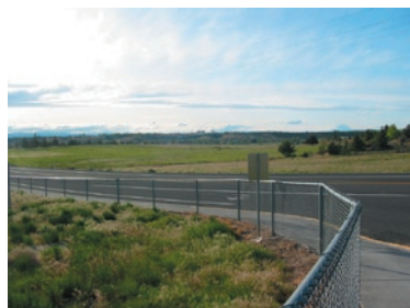
Future COCC site from Middle School