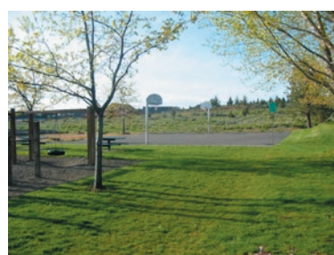
Bean Park Basketball Court