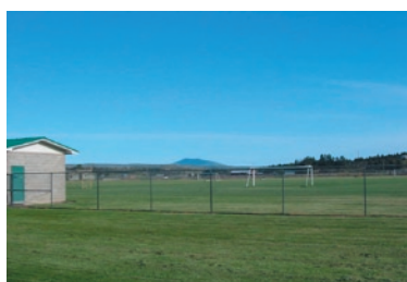
Soccer Fields south of Buff Street