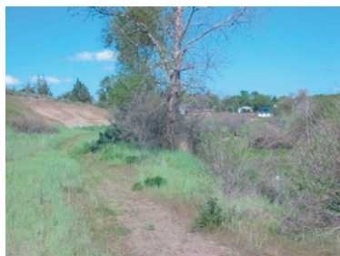
Willow Creek Trail could be continued easily along the north creek bank, following the bed of an informal trail

Recommended SDC level for 2004-2010 = $1766 (in 2004 dollars)